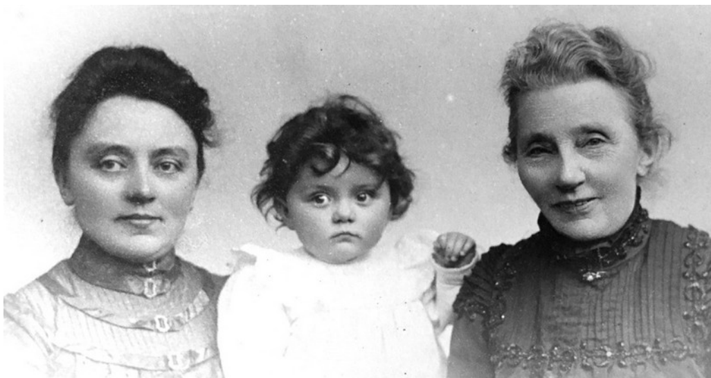
The three Wendelinas